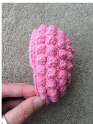
Completed 2nd body section