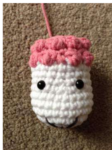
Completed head section