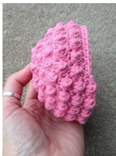
Completed first body section (the dc stitches shown here on the top right, will be where the clasp is later attached)