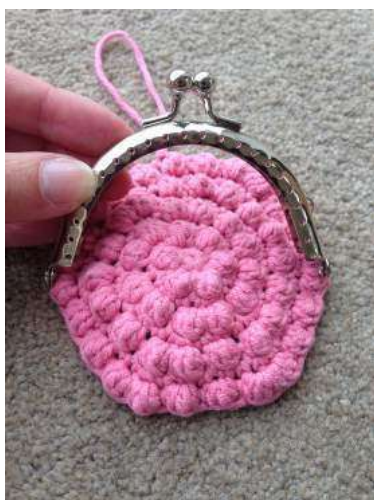
The diameter should roughly match the diameter of your purse clasp after round 8