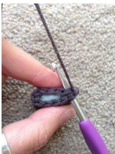
Squash flat and work through both layers